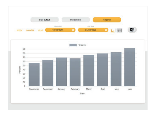
Production data for one or multiple machines, in list or chart view.